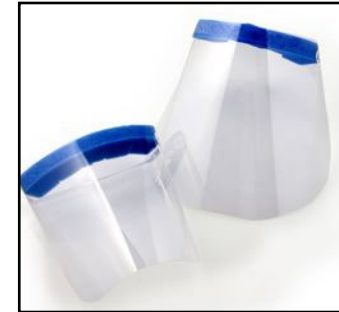
Eyes + Nose + Mouth