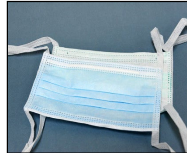
Nose + Mouth