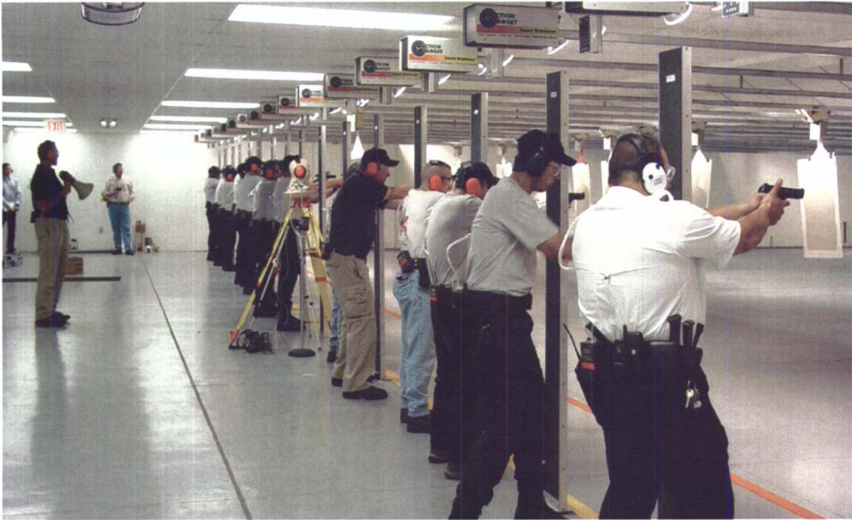
Figure 2. Noise and lead exposure assessment of law enforcement officers at a 20-lane indoor firing range.

The baseline and the most recent audiometric testing results were available for 14 of the 16 FBI instructors. Evaluations of the audiograms revealed that 9 of the 14 instructors (64%) had hearing losses that met the OSHA standard threshold shift criterion (i.e., changes relative to baseline of 10 decibels or more in the average hearing level at 2000, 3000, and 4000 Hz). Audiometric testing results were only available for one of the six firing range technicians, and this worker's results also met the OSHA standard threshold shift criterion. No audiometric testing results were available for the gunsmiths.