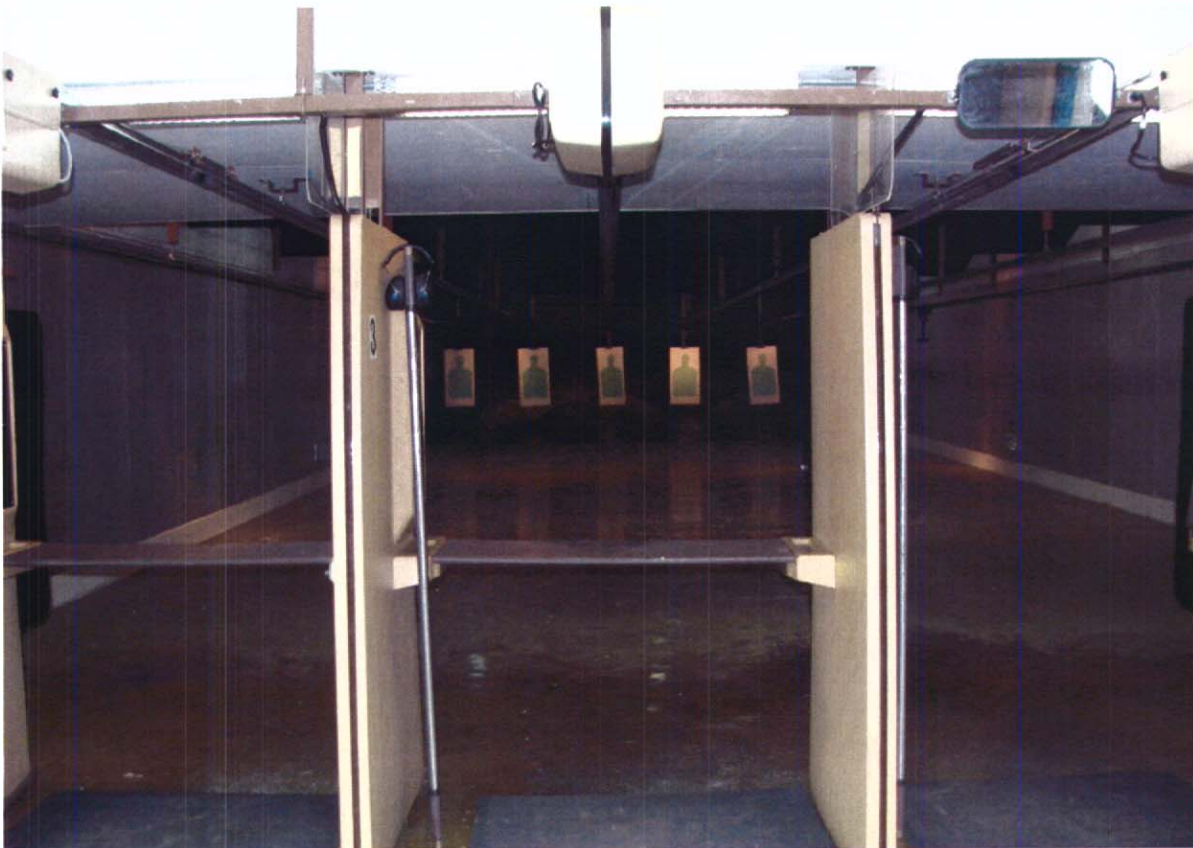
Figure 1. A law enforcement agency five-booth indoor firing range.

The other three teams used a firing range that was later documented to have extensive lead contamination. The teams showed elevated blood levels with geometric means of 27.9 \mu\text{g}/\text{dL} , 12.0 \mu\text{g}/\text{dL} , and 12.2 \mu\text{g}/\text{dL} respectively. The coaches of the 3 teams had BLLs with a geometric mean of 12.4 \mu\text{g}/\text{dL} ; the highest level was 31 \mu\text{g}/\text{dL} , which is above the level considered elevated ( \geq 25 \mu\text{g}/\text{dL} ) for adults. That firing range was voluntarily closed and arrangements were made for a thorough environmental evaluation.