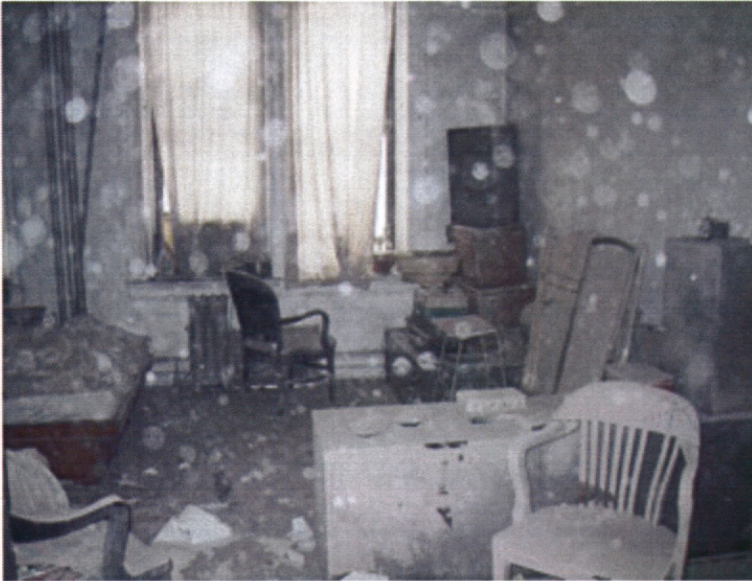
back room with only one broken window