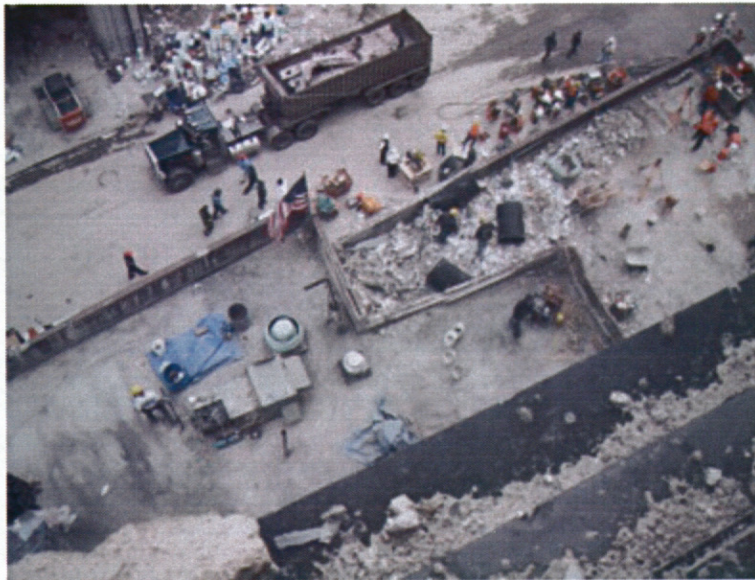
from kitchen window