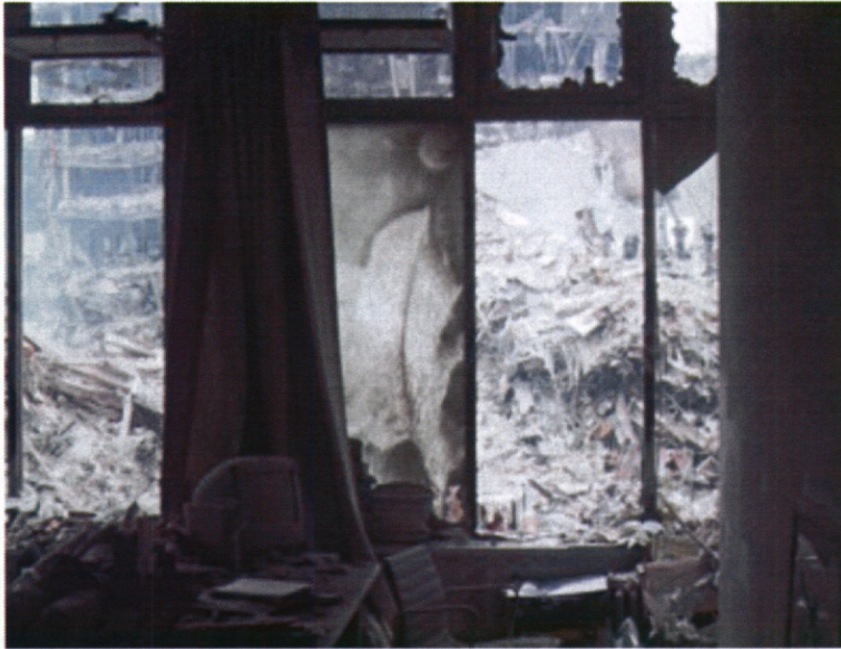
from apartment 2N