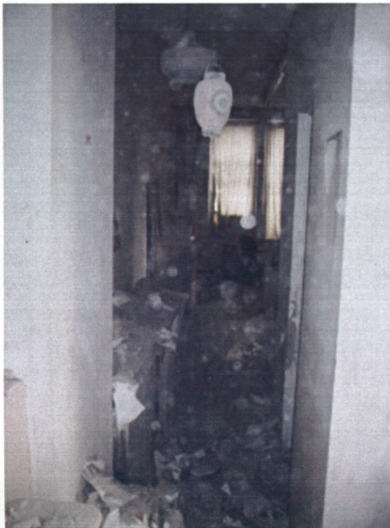
internal hallway - papers mostly from Canter Fitzgerald