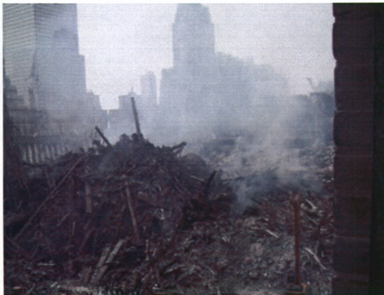
the fires created new toxins we were exposed to for months as well as what was in our home and what we ran though that day