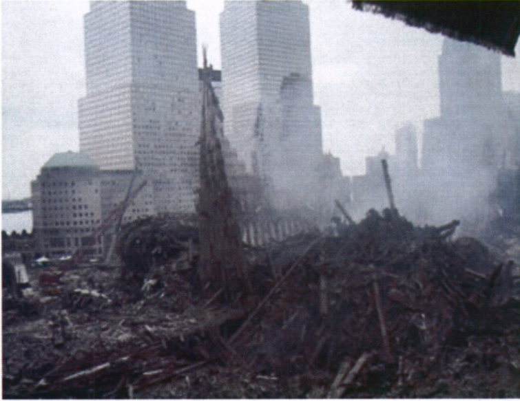
from kitchen window