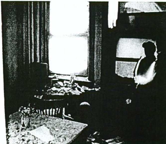
my apartment 8th floor south (8s