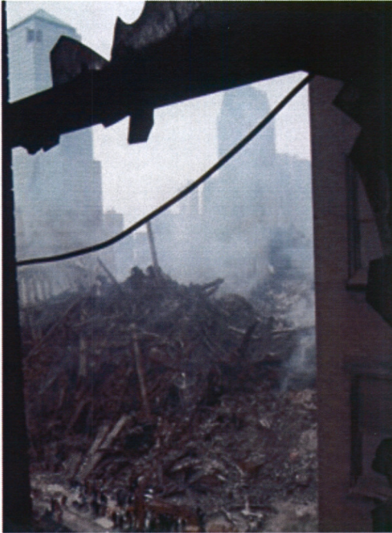
from one of my windows