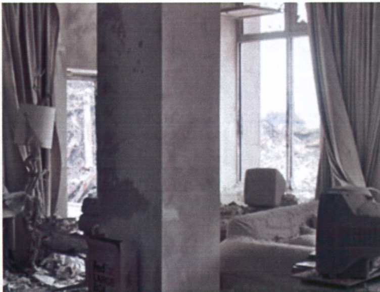
second floor apartment 2N