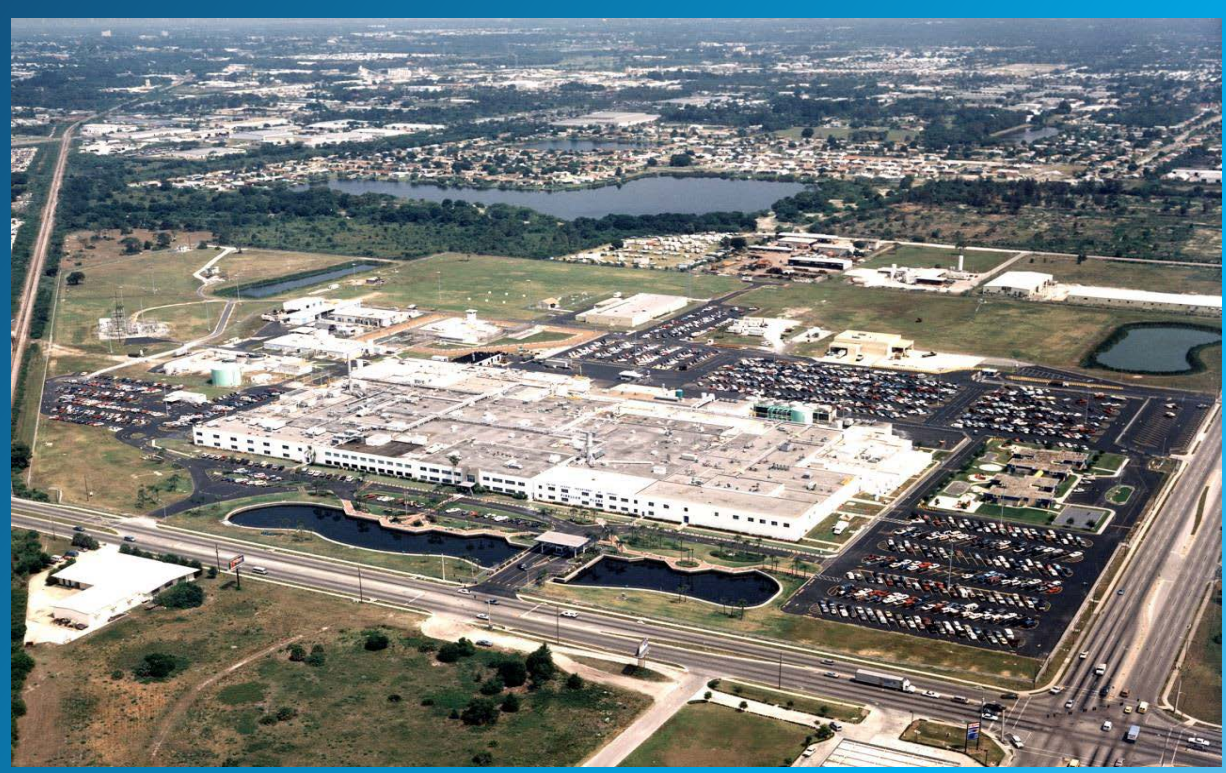
Aerial photo of the Pinellas Plant [Gueretta 2015]